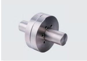
磁力传感器 Component of magnet load