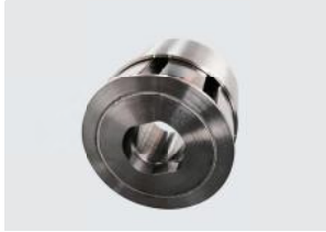
高压水枪磁制动器 Magnetic brake for water blasting gun