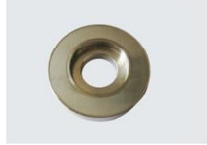
激光焊接密封磁路 Magnet sealed by laser welding