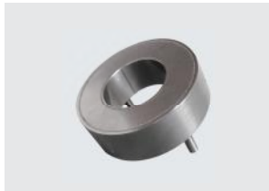
带螺栓密封吸力件 Encapsulation magnets