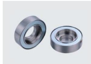
吸力件 Magnetic pots